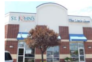
ADP-Edwardsville 1015 B Century Dr.

2012 included major efforts by staff and board members to find a location outside Collinsville for a second Adult Day Program. What we expected to be a journey of a few months eventually took more than a year, but God led us to a space we believe will enable us to provide this valuable service to many more families in the Edwardsville area. We signed a lease in the fall and are on target to open in mid-February. Having a physical presence in Edwardsville will also help caregiving families to find our Home Services and support groups. Other highlights: